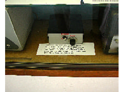
QRP transmitter that made world wide contacts using only flash light batteries.