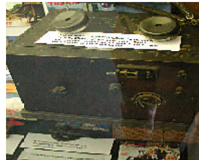
Homebrew "wireless" radio made in 1927 by local man.