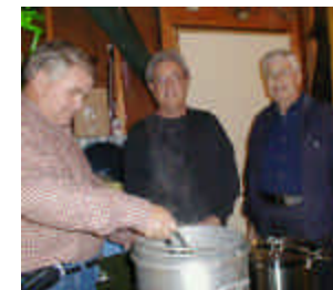
KD4BUF stirs the noodle pot.