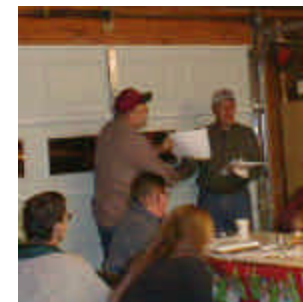
KM4D distributes Field Day Award to K14LLU