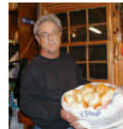
KD4WMC shows off his famous yeast rolls.