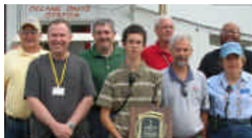
K4AVR, N4DOU, KG4BZK, N3ZL N4JJ, N4MXP, KG4YVJ, KO4L