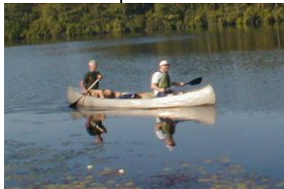
Sunday Morning Maritime Mobile Operation

When operations ended at 2PM, everyone helped with the clean-up. Many hands made light work and we had all of the antennas down and stowed, the food repackaged, the kitchen and floors cleaned and the trash collected well before 3PM which was very timely because as the final cars left the parking lot, we had a very strong thunder storm which