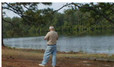
Raising the 10-Meter GOTA Antenna

(GOTA) station at a covered pavilion nearer the entrance of the park. This included an information station and several local residents came to ask questions. The