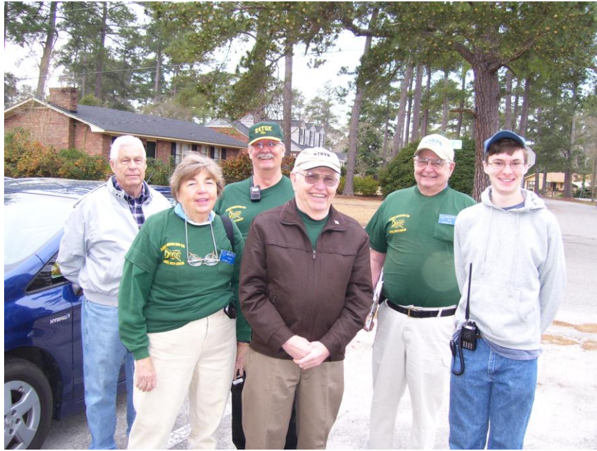
McLeod Run/Walk - March 16