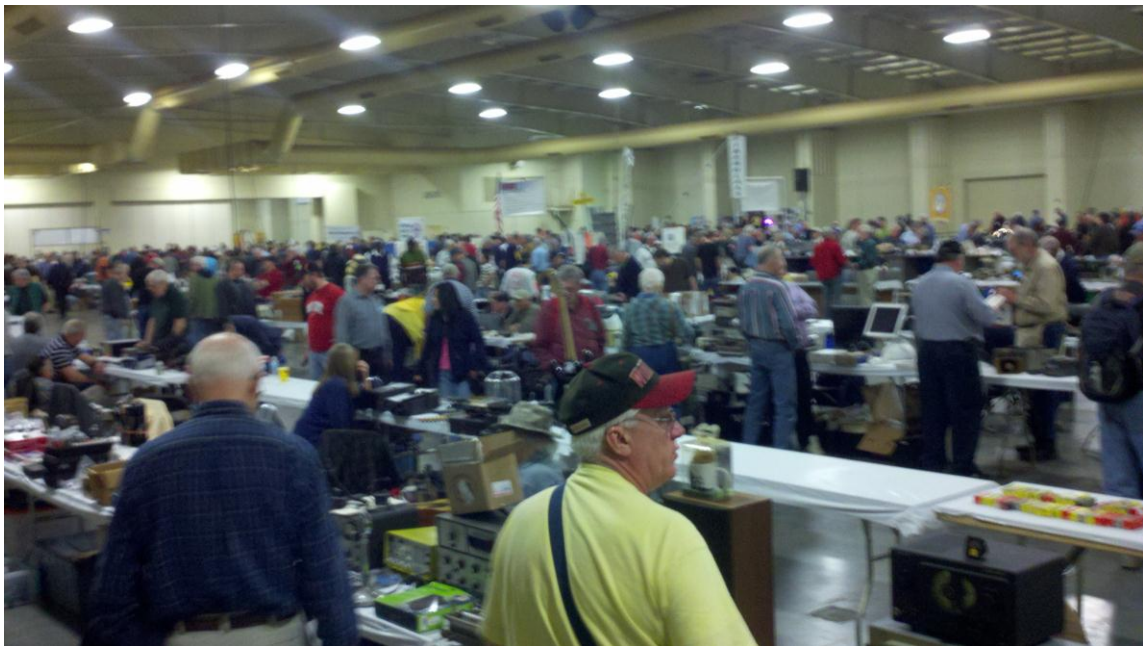
Charlotte Ham Fest – March 8 and 9, 2013